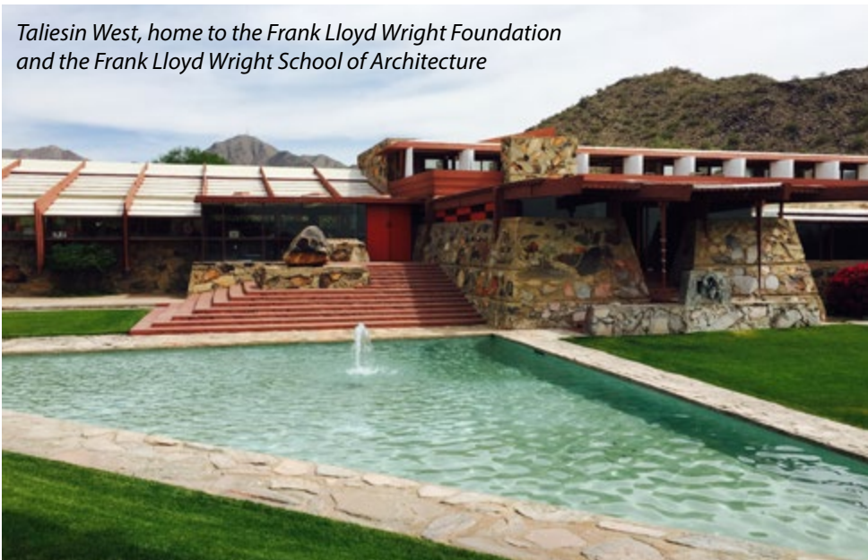
Taliesin West, home to the Frank Lloyd Wright Foundation and the Frank Lloyd Wright School of Architecture