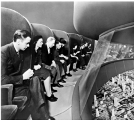
Futurama exhibit, New York World's Fair, 1939.

The reinvention of the community was the focus of the Norman Bel Geddes designed General Motors Futurama exhibit at the fair. Fair goers soared over 500,000 miniature homes arranged in a diorama where zones were connected by expressways while the speakers in their seats whispered that traffic congestion would be eliminated in the arrangement of transportation and land use they were glimpsing in the model. ( https://dp8hsntg6do36.cloudfront.net/5171b439c2b4c00dd0c20301/high.webm ).