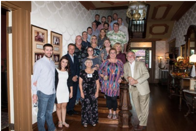
Attendees at the 2016 Fall APA AR Conference at The Clayton House in Fort Smith.